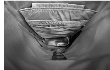
Notebook sleeve for laptops