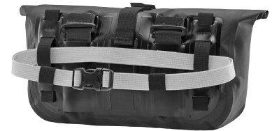
Can be used as a shoulder or hip bag with included strap