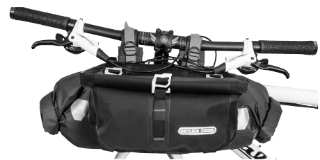
More capacity: Accessory-Pack mounted to Handlebar-Pack (optional accessory)