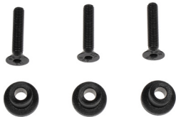
QL3.1 studs (incl.)