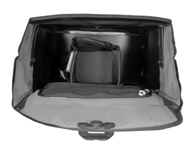
Zippered inner pocket for display