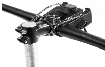
View in installed condition