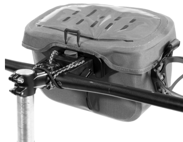
Example of use with Ultimate