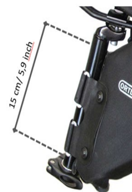
Space required for mounting Seat-Pack 16.5 L to the seat post