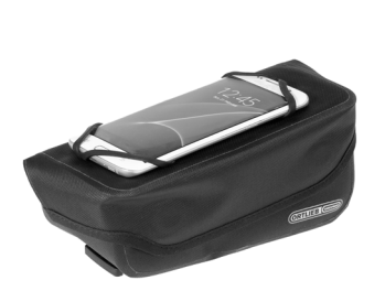
Top view with silicone Cell phone holder