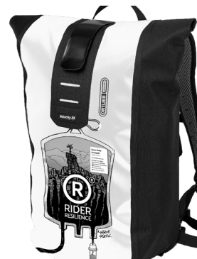
Design „Riders Resilience“