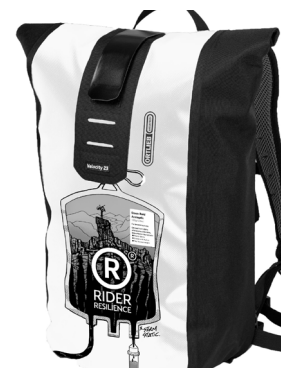
Design „Riders Resilience“